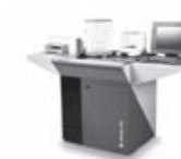
USTER® AFIS PRO The fiber process control system