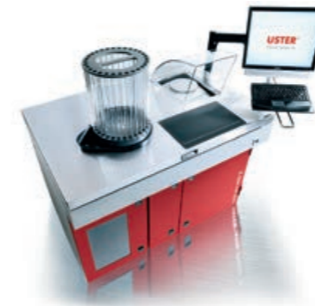
USTER® AFIS PRO 2 The standard fiber-testing system for process control

USTER started with field trials and sales of the first single-fiber-measuring systems in 1990. For the first time, an instrument was capable of automatically determining the number and size of neps. AFIS® stands for advanced fiber inspection system.