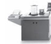
USTER® AFIS Second product development of USTER® AFIS