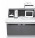
USTER® AFIS First development of single-fiber-testing system for cotton